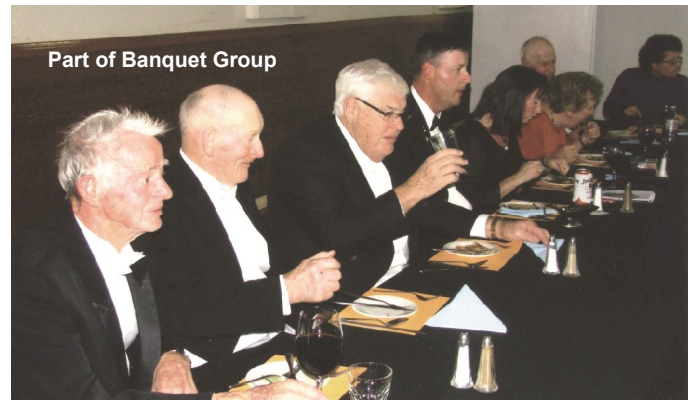
Part of Banquet Group