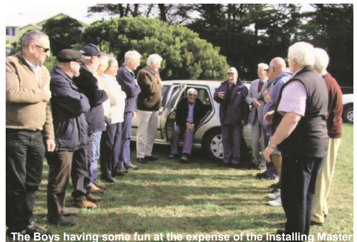
The Boys having some fun at the expense of the Installing Master