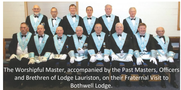
The Worshipful Master, accompanied by the Past Masters, Officers and Brethren of Lodge Lauriston, on their Fraternal Visit to Bothwell Lodge.