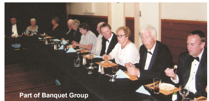
Part of Banquet Group