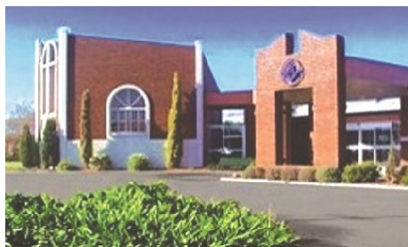
Masonic Peace Haven