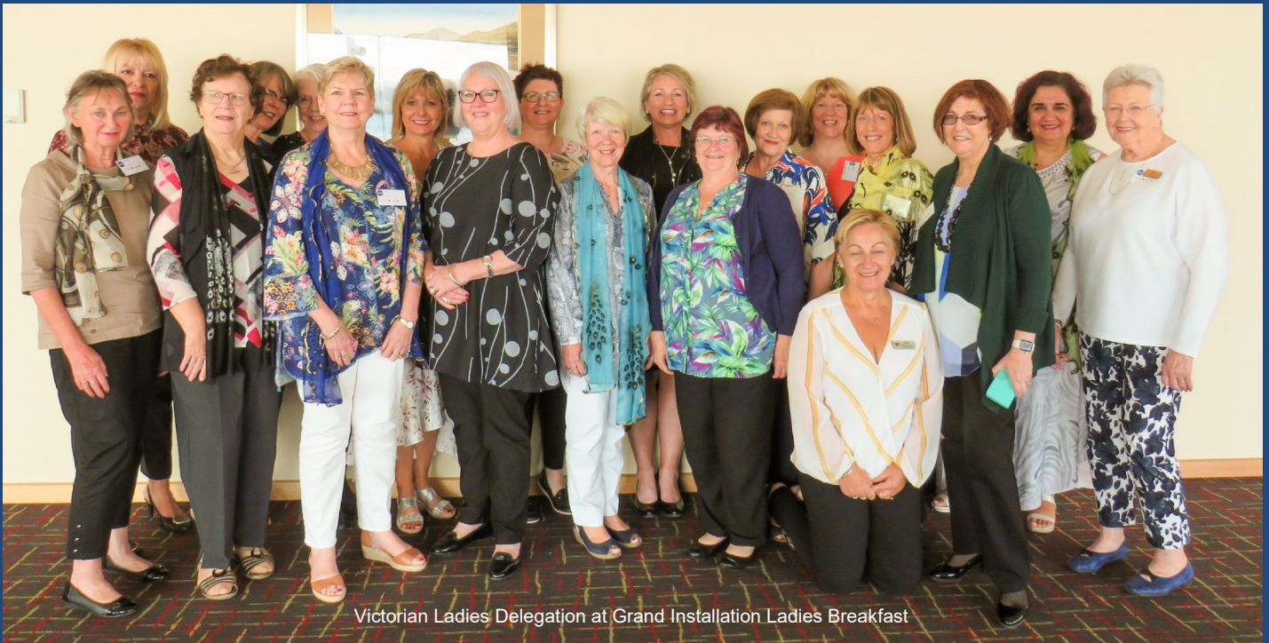
Victorian Ladies Delegation at Grand Installation Ladies Breakfast