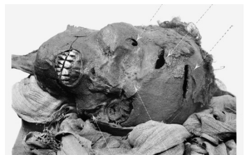
Mummified head of Seqenenre depicting his battle wounds

His sons, Kamose and Ahmose succeeded to the throne after their father's death and it was they who ultimately made the final conquest of the Hyksos and reunited all of Egypt around 1500 BCE.