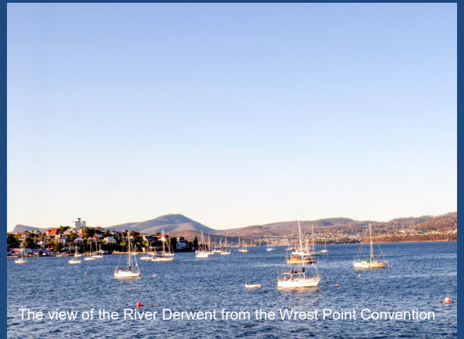
The view of the River Derwent from the Wrest Point Convention