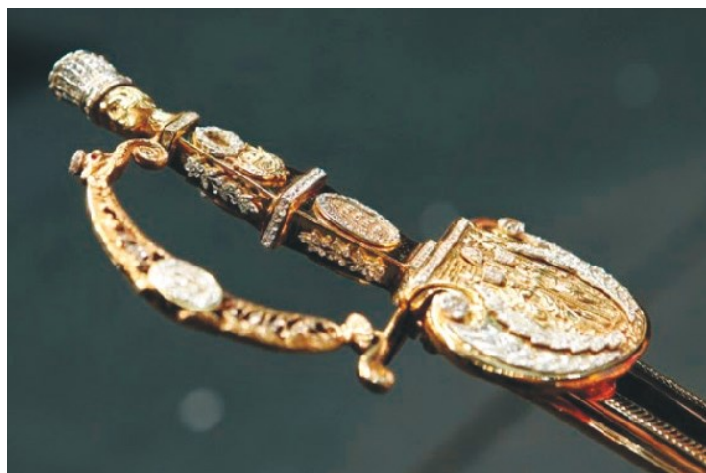
Simon Bolivar's Sword

Simon Bolivar was a Venezuelan military and political