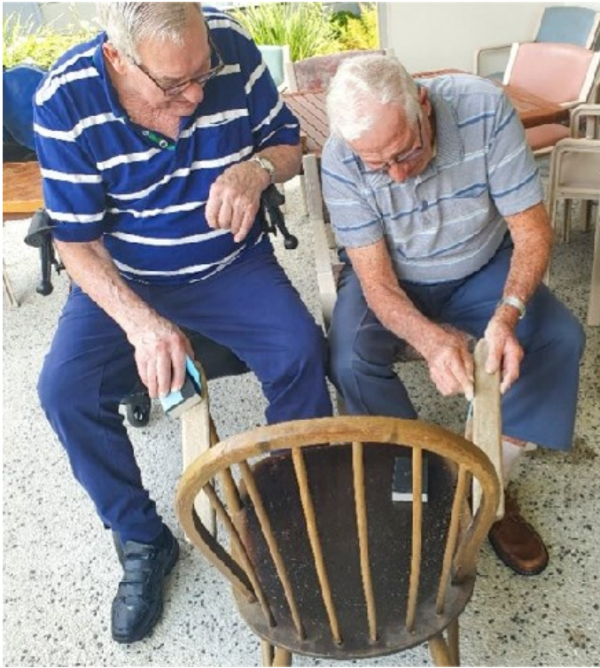
Day Therapy Centre Donation to Dog's Homes of Tasmania

Some of the projects this year have included the restoration of furniture and wooden trinket bowls. It is a terrific opportunity for MCT residents to be creative in a productive and energetic group activity.