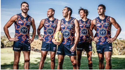
2018 Adelaide Indigenous players, celebrating Sir Doug Nicholls Indigenous round