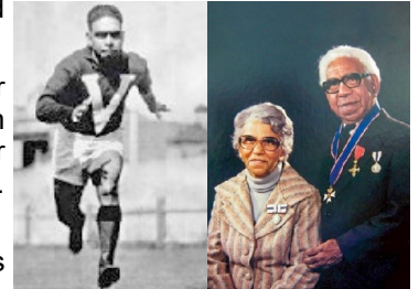
An athletic Nicholls playing Aussie Rules. Sir Doug Nicholls with his wife Gladys

Nicholls was a Christian minister, social worker with Aboriginal people who pioneered for reconciliation and was Governor of South Australia. Nicholls was named Victorian 'Father of the Year' in 1962 and was notably the first Aboriginal to be knighted. Sir Douglas Nicholls (1906-1988) was initiated into Lodge Antioch No. 570 in 1954. (Victoria).