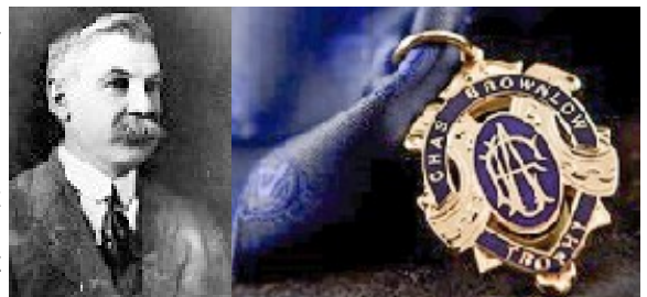
Charles Brownlow also known as Chas and the prestigious Brownlow Medal

Perhaps one of the most revered players and contributors to the game was Charles Brownlow. Following his short playing career for Geelong, Brownlow invested many of his finest years as an administrator for Geelong, the VFL and served as caretaker president of the VFL from 1918-1919. He became president of the Australian Football Council in 1919, serving in that position until his death in 1924. Today, the Brownlow Medal which was established and first awarded in 1924 is regarded as the highest honour that can be bestowed upon an AFL player or players for 'Best and Fairest' conduct throughout each football season. Charles Brownlow (1861-1924) was