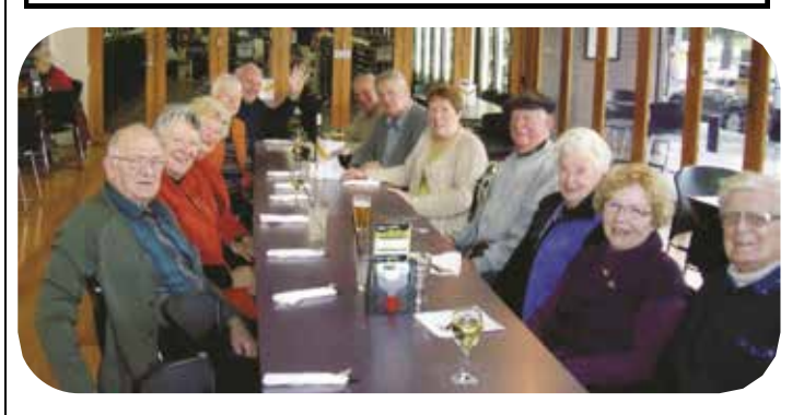
Masons and Mates enjoying each other 's company at Olive's Restaurant

14 Gregory Street Sandy Bay Tasmania 7005 Tel: (03) 6223 5822 Fax: (03) 6224 9812