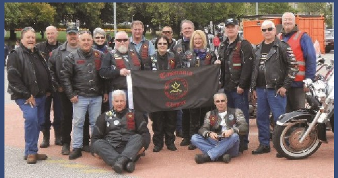
Attendees at the Masonic Motorcycles Association of Australia, 2013 Annual General Meeting held in Tasmania.