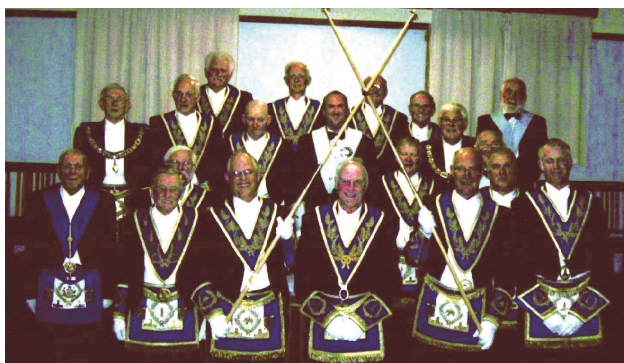
Grand Lodge Installation Team