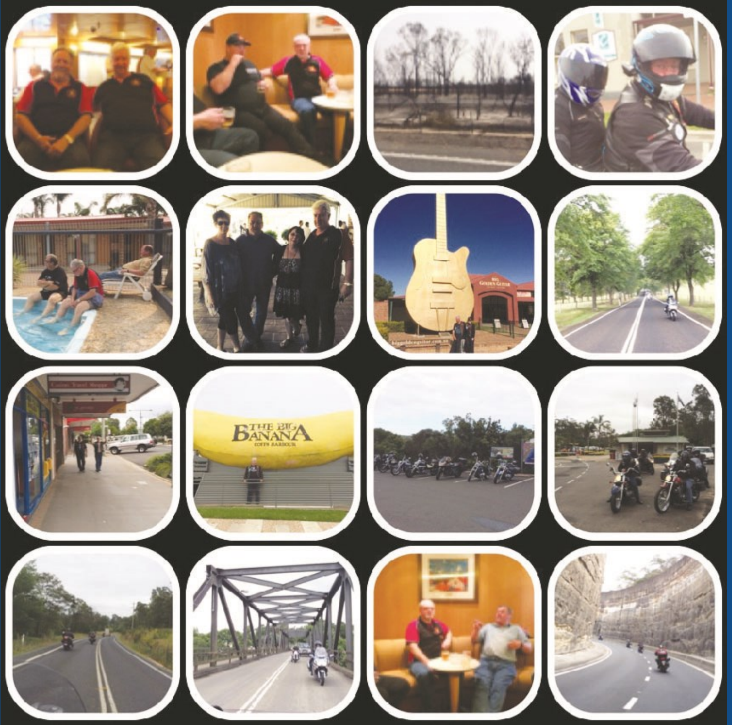
Photo collage from the Tasmania Delegation's trip to the MMAA Annual General Meeting - Please see story page 14