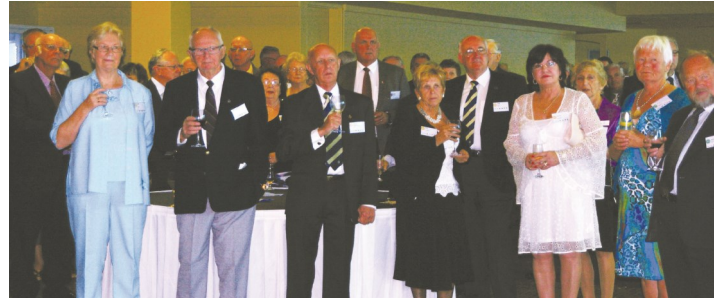
Guests enjoying the speeches