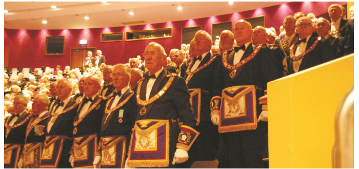
Representatives from Visiting Delegations