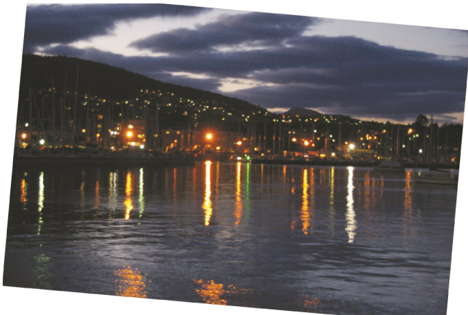
Evening view from the Convention Centre