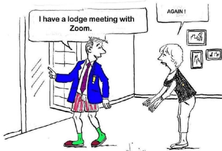
FREEMASONRY IN COVID-19 DAYS