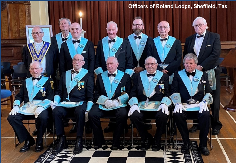
Officers of Roland Lodge, Sheffield, Tas