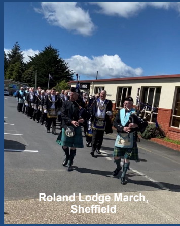
Roland Lodge March, Sheffield