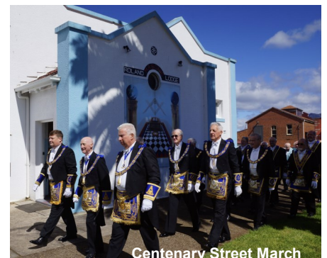
Centenary Street March