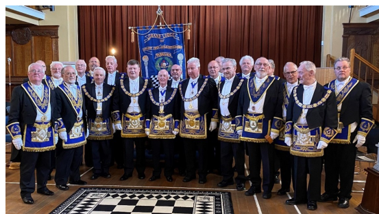
Grand Lodge Ceremonial Team in attendance