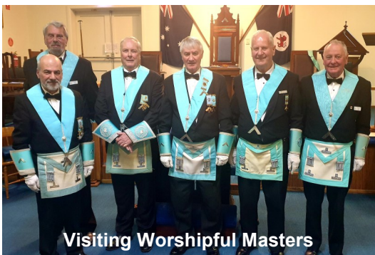
Visiting Worshipful Masters